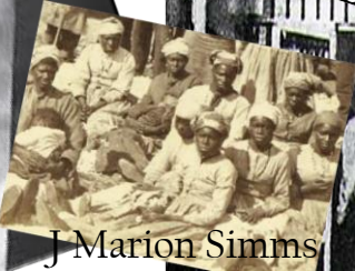
J Marion Simms